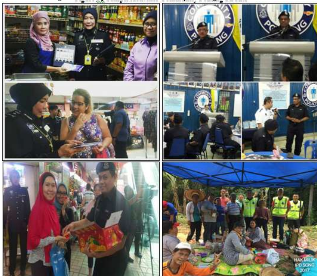
Figure 2 : Sample Activities Community Policing PDRM