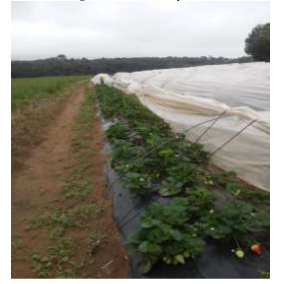
Figure 3 - Strawberry Beds

The following figure demonstrates strawberry growing grounds: