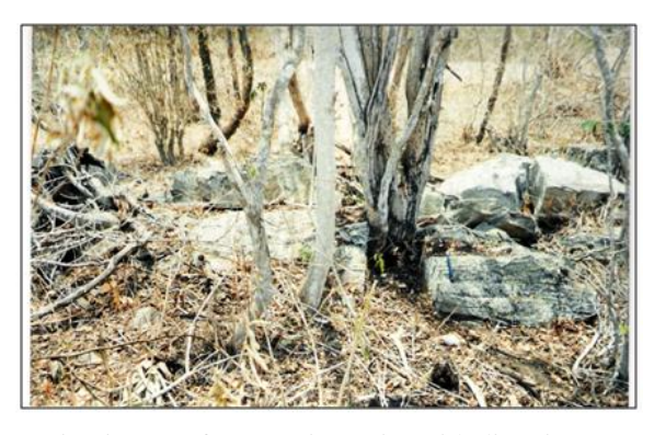
Photos 01 and 02 - Pseudopiptadenia contorta growing in open fractures in gneiss with direction E-W.