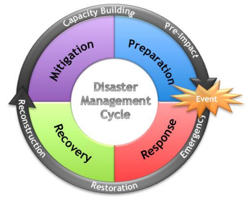
Chart 1: Disaster management cycle