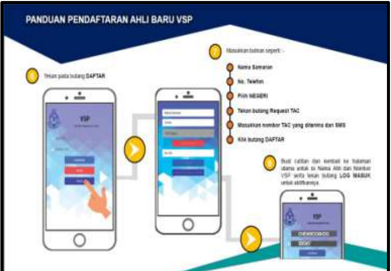
Figure 1: Use of this VSP Application can be downloaded via mobile phone by using App Store or Play Store