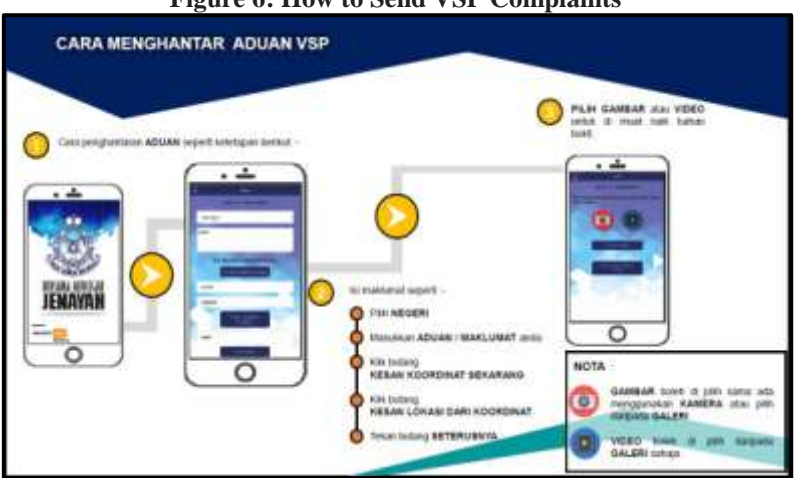
Figure 6: How to Send VSP Complaints

Figure 3: The process of sending VSP complaints that is channeled by the community only with select state, complaint / information entry, current coordinate effect, effect of coordinate location and finally information sent to facilitate PDRM to take further action