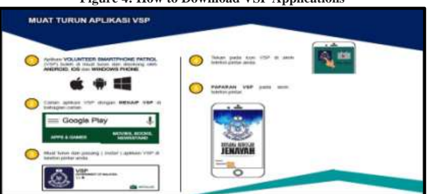
Figure 4: How to Download VSP Applications

Application of VSP's appraisal can help the public to get a list of important numbers in case of any problems. To make it easier for people to get information and services it also comes with the convenience of Google Map. (Corporate), 2016)