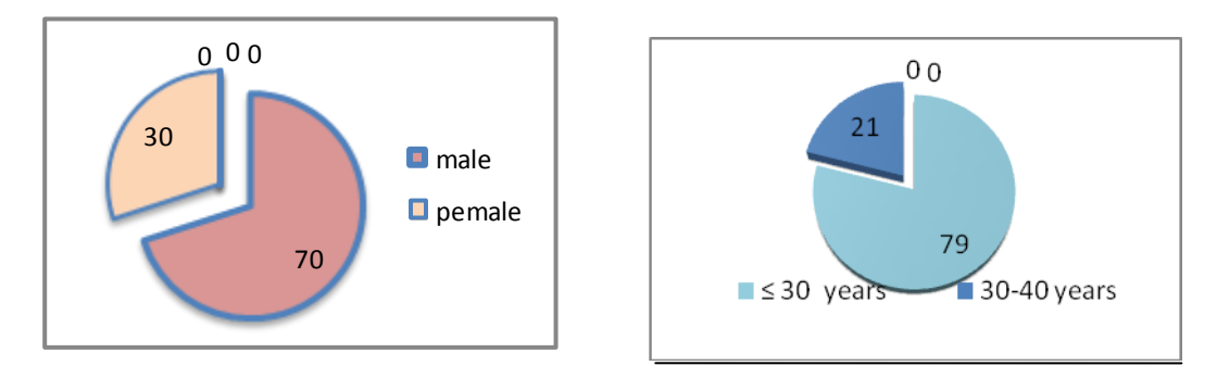
Figure 4.1 Respondents Characteristics by Sex and age

Respondents most widely become servants dominated by men as much as 70 percent while 30 percent of women. Based on the result of restaurant managers that emphasizes speed in service so that the necessary roles of men, while women are more prominent state employees to perform reception guests who visit the restourant.